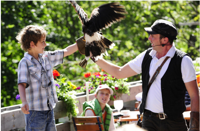
The falconers at Falconry Galina invite you to take an Eagle Adventure walk with their feathered friends, and there are loads of other routes around JUFA Hotel Malbun***S for the whole family to explore.