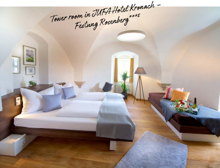
Tower room in JUFA Hotel Kronach – Festung Rosenberg****

Impressive – that is how to describe JUFA Hotel Pyhrn-Priel*** in the heart of the Kalkalpen National Park region in Upper Austria. It is located right in the middle of the massive complex of Spital am Pyhrn Abbey. JUFA Hotel Murau*** is housed in the oldest building of the JUFA chain where there was once a brewery during the Middle Ages.